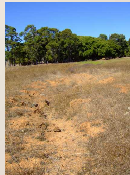
Revegetation programme - BEFORE