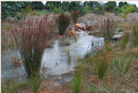
Revegetation programme - AFTER