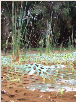
Dam spillway revegetation