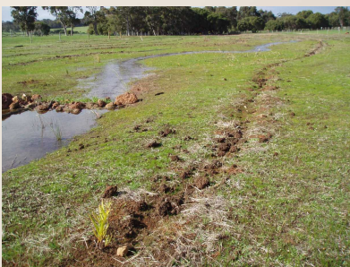
Revegetation programme - PREPARATION