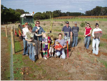
Revegetation programme with Cape to Cape Catchment Group