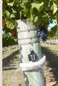
Dacron Collars for trapping insects