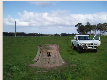
The future – replacing old growth forest