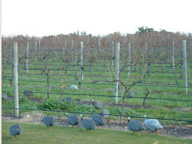
Guinea Fowl roaming for Garden Weevil and Mealy Bug